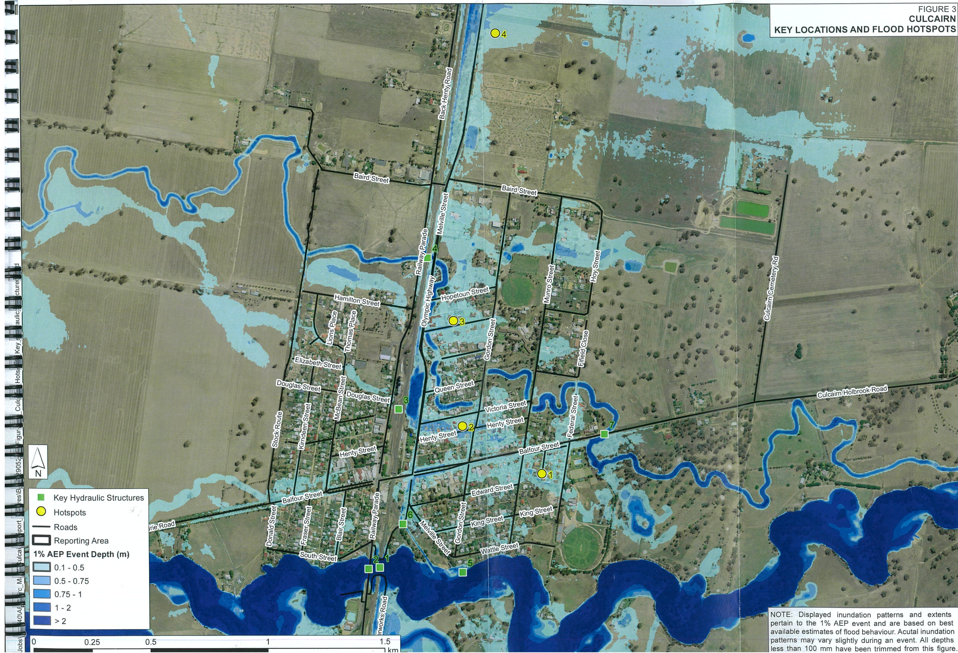
FIGURE 3 CULCAIRN KEY LOCATIONS AND FLOOD HOTSPOTS

NOTE: Displayed inundation patterns and extents pertain to the 1% AEP event and are based on best available estimates of flood behaviour. Actual inundation patterns may vary slightly during an event. All depths less than 100 mm have been trimmed from this figure.